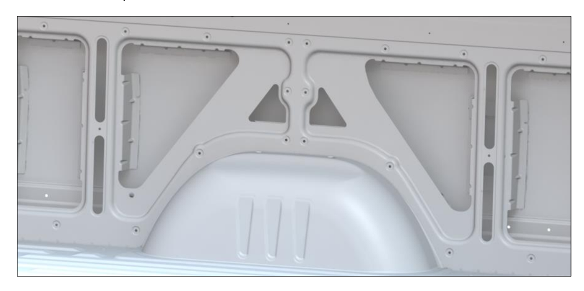
"Vehicle's bare metal in the wheel well area" This is view from inside the vehicle

Note: The top and bottom flanges of the Legend Wheel Well Covers need to be in contact with metal of the van at all times. So, any flooring or wall liners from Legend need to be installed in the van after 'Step # 2'.